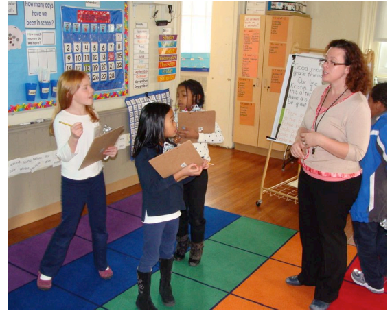
Ms. Ford and a group of second graders conduct an energy audit during lunch. In one classroom alone, they identified 14 energy saving opportunities!